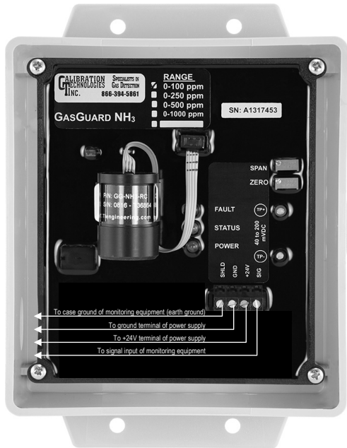
Figure 2: Wiring diagram